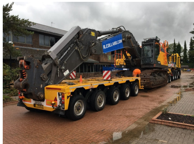
75Ton Excavator Arrives 24 th Sept.