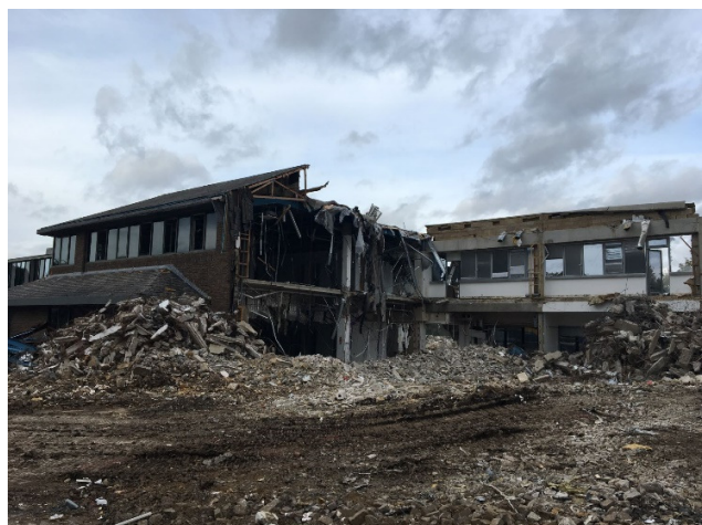
10day later, 90% Complete

For further information or to discuss how we could help your project please email Building1CroxleyPark@isgplc.com